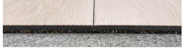
Close-up view of edge of flooring.