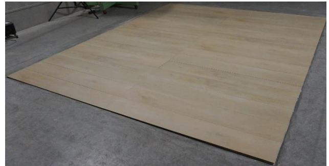
Test specimen installed in laboratory for test.