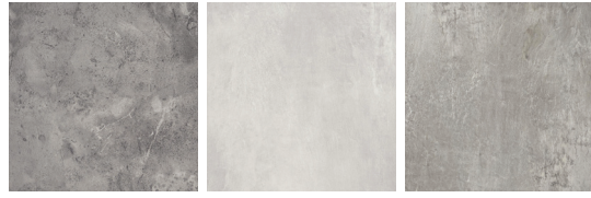
Forged - V2 Misty Quart - V2 Tempered - V3