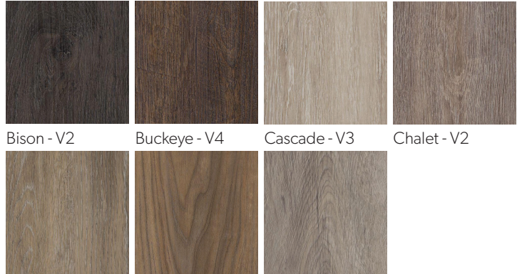
Bison - V2 Buckeye - V4 Cascade - V3 Chalet - V2 Grand Teton - V4 Spice - V4 Stoney Oak - V3