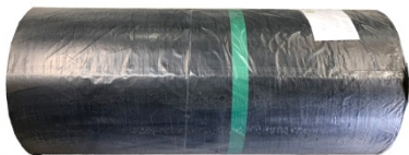
Fig. 1 - GREEN MARKED Face is inside of roll