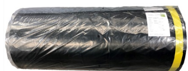
Fig. 2 - YELLOW MARKED Face is outside of roll

Caution: The roll material is stretched slightly when stored on the cylinder coils. Allow extra length for pullback when cutting material into manageable lengths (minimum 100mm per cut length).